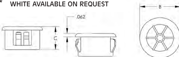
-----CHASSIS DIMENSIONS PART DIMENSIONS-----